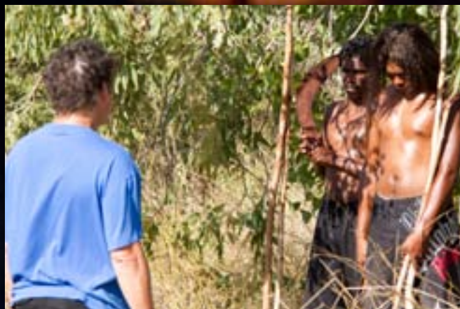
Telling Our Story Film Shoot