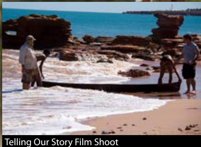
Telling Our Story Film Shoot