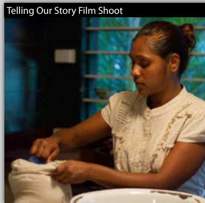
Telling Our Story Film Shoot

There are various local commercials in production and there are preparations being made for up and coming live events to be filmed like the GimmeFest 2010. There has been a writer's workshop with professionals from the east coast coming to Broome mentoring for a future TV series in development. There are some major TV productions in their early stages and these will see a new and exciting direction for GTV.