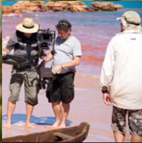
Telling Our Story Film Shoot