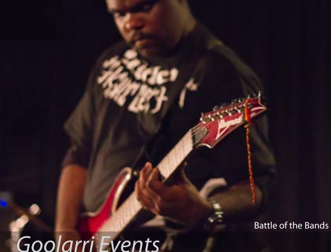
Battle of the Bands