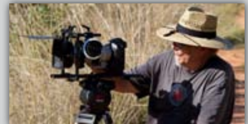
Telling Our Story Film Shoot

Please feel free to come and visit Goolarri at any time, and we welcome any feedback or suggestions you may have to improve our service to you.